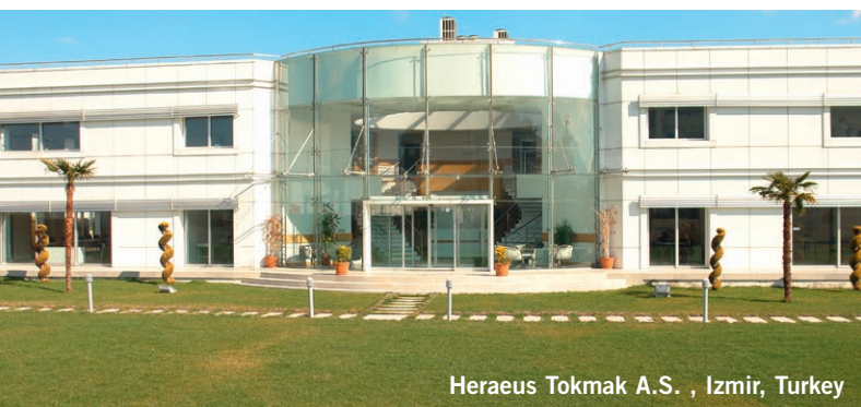
Heraeus Tokmak A.S. , Izmir, Turkey

The current portfolio includes over 200 different products. One hundred and fifty of these products were successfully transferred from Heraeus in Hanau to Heraeus Tokmak